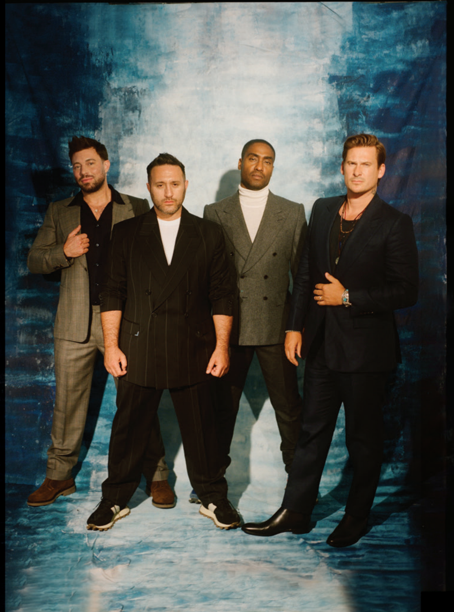
Lee - Suit Edward Sexton T-Shirt All Saints Shoes Russel & Bromley Jewellery His Own / Antony - Suit Han Kjobenhavn T-Shirt American Vintage Shoes Tod's Simon - Suit jacket Edward Sexton Trousers Mr P Roll neck Boss Necklace Serge D'nimes Trainers Tod's / Duncan - Suit Edward Sexton Shirt Boss