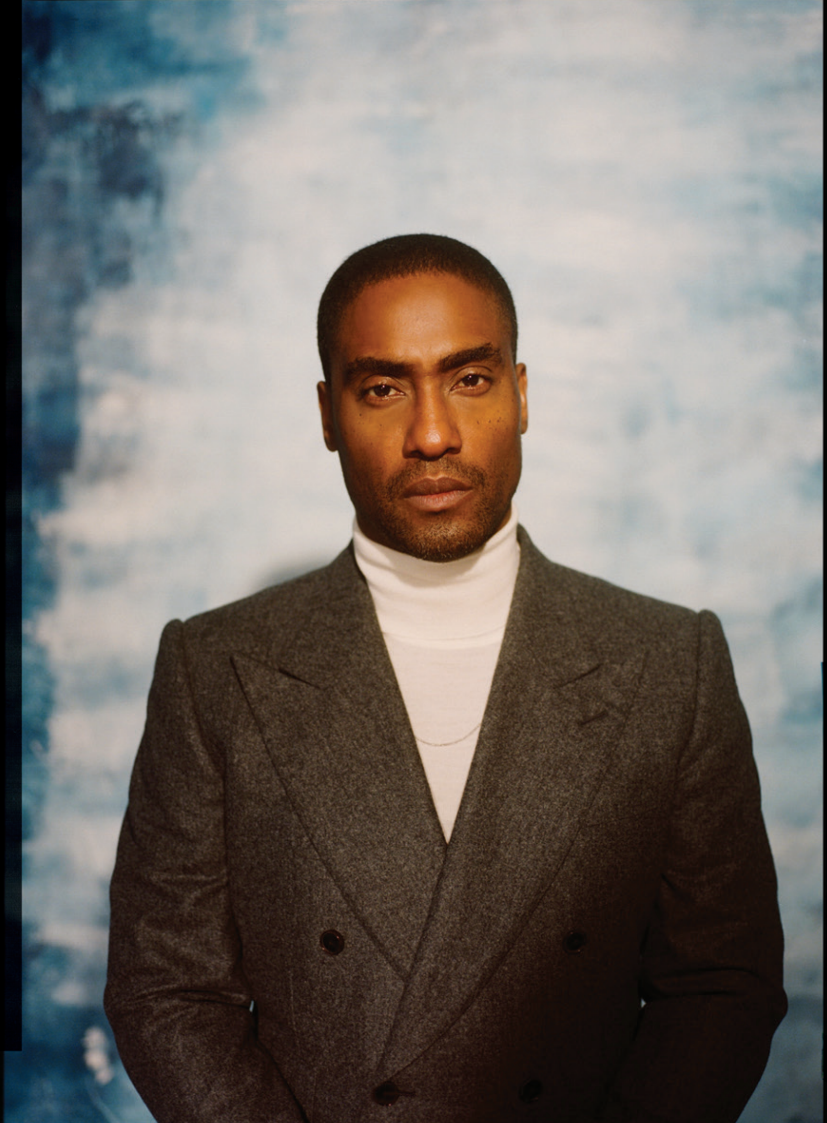
Suit jacket Edward Sexton Roll neck Boss Necklace Serge D'nimes