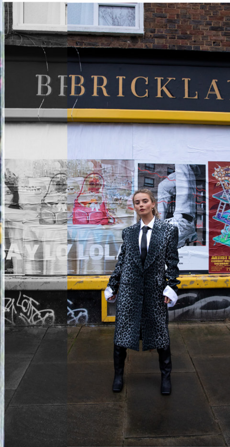
White shirt ETON Leather tie stylists own Leopard coat and skirt MICHAEL KORS COLLECTION Square toe leather boots DEAR FRANCES Heart and pearl earrings HEY HARPER Gold ring HEY HARPER