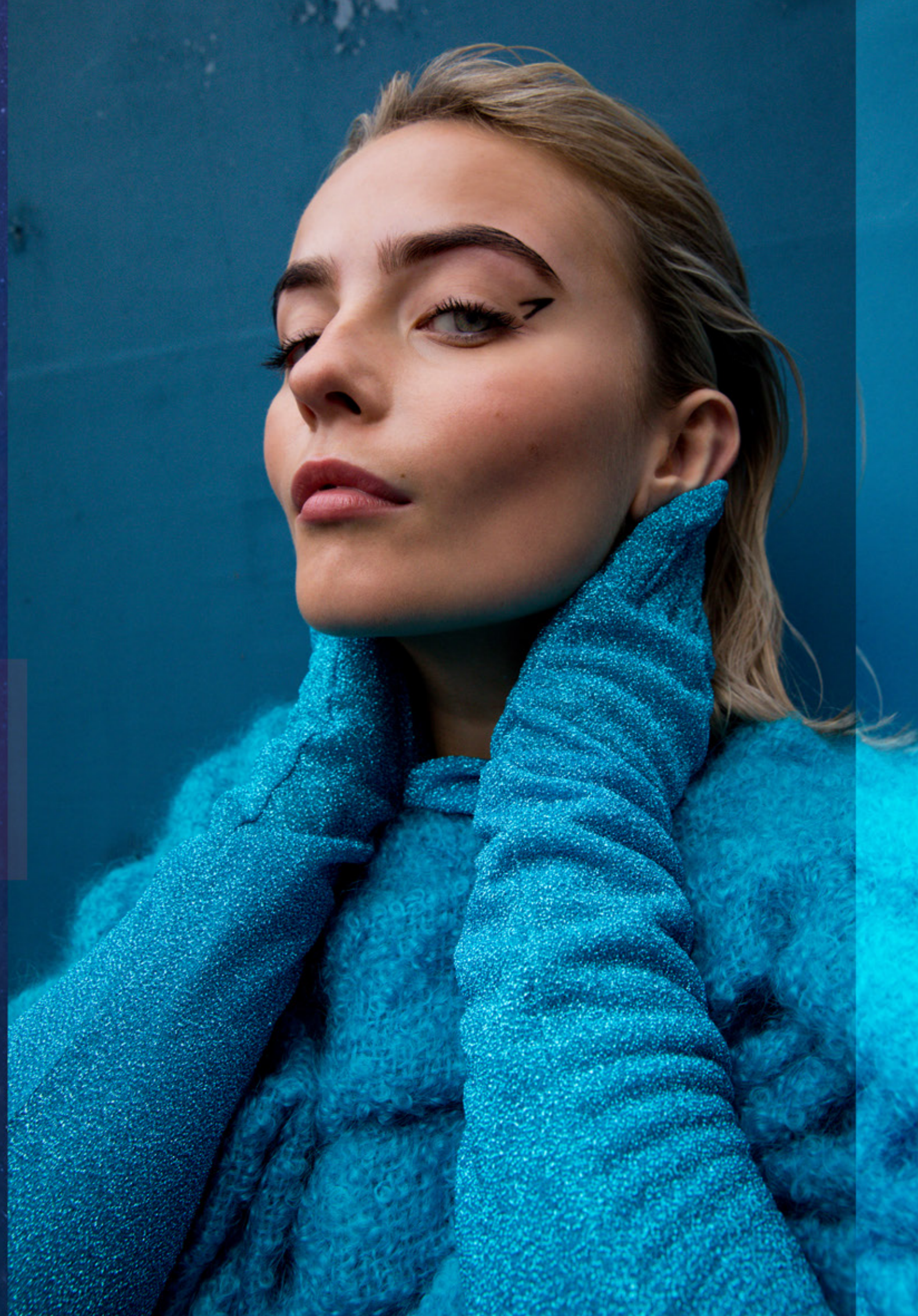
Bodysuit, leggings, skirt, cape and gloves SAFIYA

With the 60th-anniversary specials having finished their run as of December 9th, we saw the exit of David Tennant's 14th Doctor and Catherine Tate's Donna Noble, paving the way for Ncuti Gatwa's 15th incarnation of the titular character. A new era (and a soft relaunch) of the show, Whovians both young and old are waiting with bated breath to see what Russell T. Davis has up his sleeve. Now, with an even bigger budget (thanks, Disney +) Doctor Who is being thrust onto the international stage in a way it never has been before, leaving the show open to welcome and embrace a fresh audience.